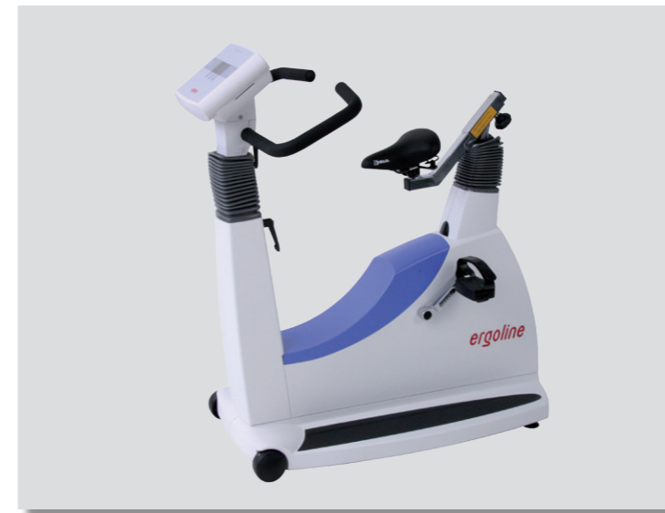
ergoselect 200 as pediatric ergometer