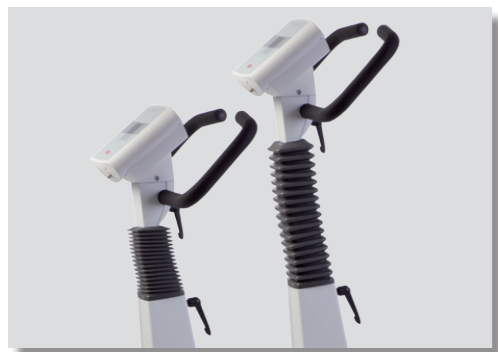
Continuously adjustable handlebar (height)