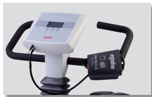
Automatic blood pressure measurement