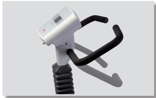
Continuously adjustable handlebar (angle)