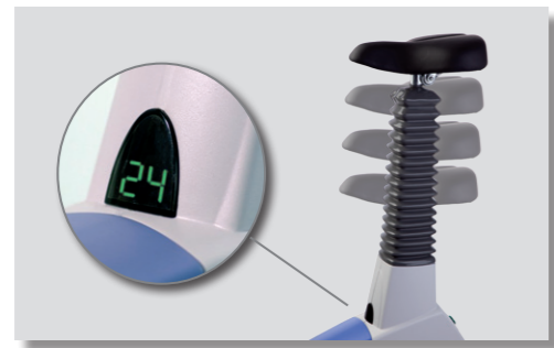
Motor-driven saddle height adjustment with height indication