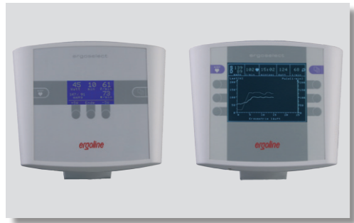
Different control units (P and K)