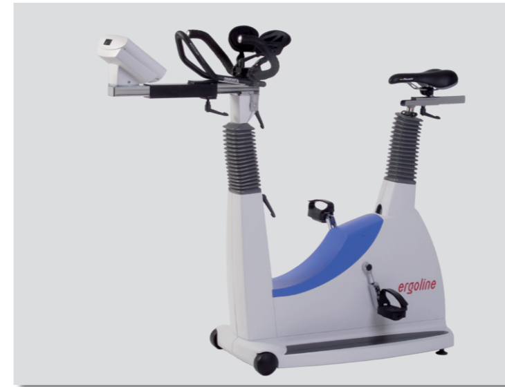
ergoselect 200 with triathlon handlebar and equipped for athletic training

By means of the dual adjustment capability for the handlebar (height and angle) the ideal position of the upper body and the angle that the legs form with the cranks can always be optimally adjusted. Special add-ons, such as saddle adjustment and variable cranks, allow the ergometer to be used for testing the physical performance of athletes and for pediatric exercise tests.