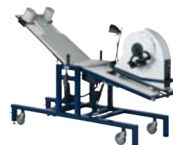
ANGIO IMAGING ERGOMETERS