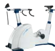
EXCALIBUR SPORT ERGOMETERS