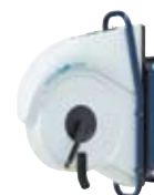
ANGIO ARM ERGOMETERS