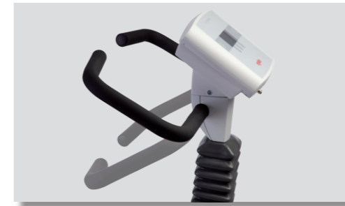
Continuously adjustable handlebar