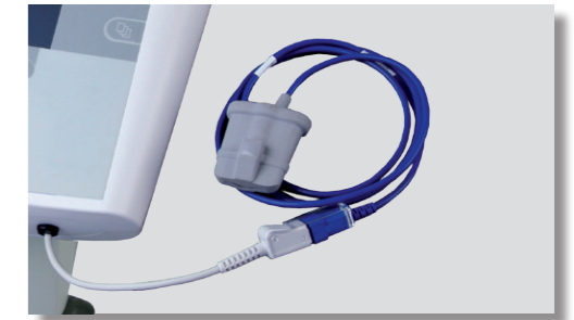
Oxygen saturation measurement