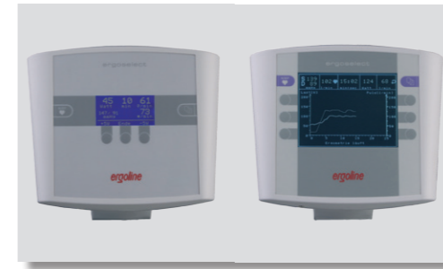
Different control units (P and K)