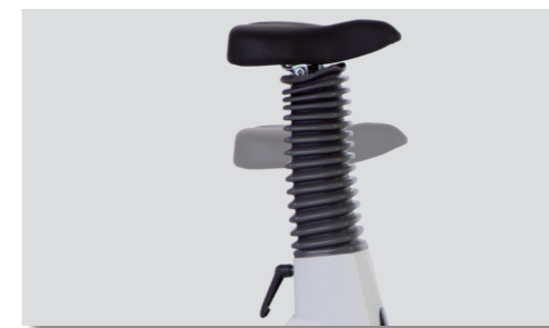
Continuously adjustable saddle height