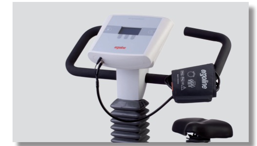
Automatic blood pressure measurement